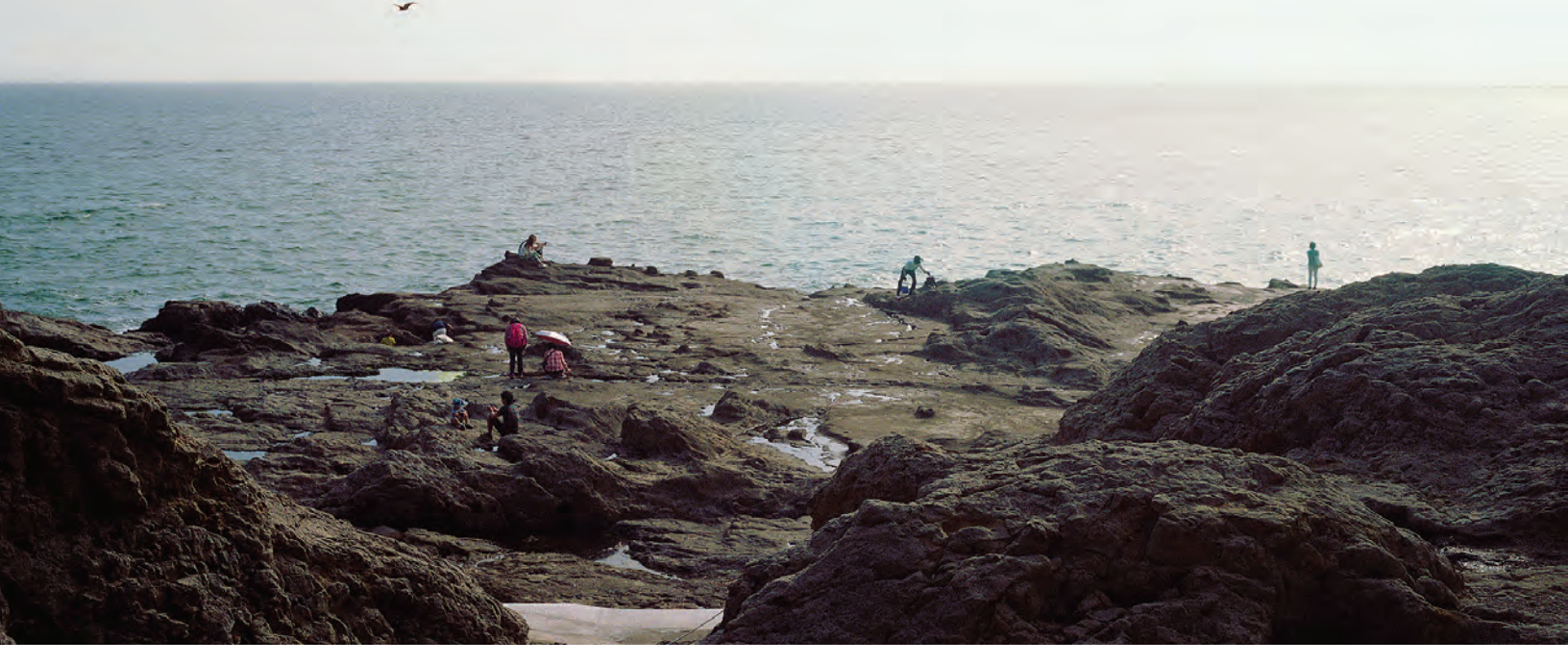
Taken on the island of Enoshima in Japan's Kanagawa Prefecture, this photograph is among a sample set of landscape photographs and paintings that are being used to investigate the role of the golden mean ratio and its connection to the illusion of depth in the "Space and Place: Perceiving Depth in Contemporary Landscape Art" Faculty Collaboration Grant project.